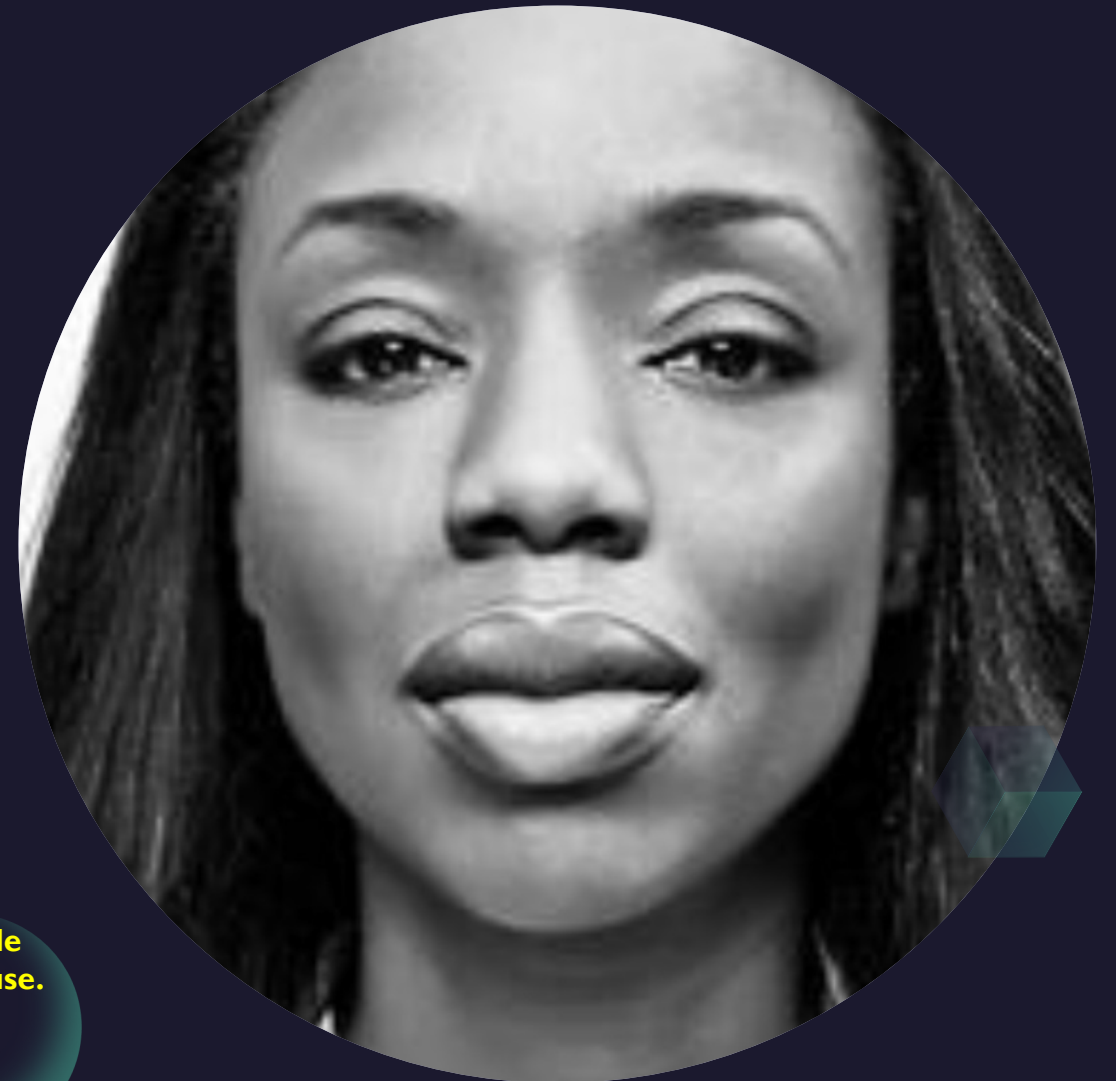
Dr. Nadine Burke Harris, Former Surgeon General of the State of California “The science is clear: Early adversity dramatically affects health across a lifetime.”